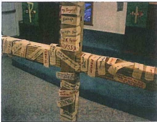
Pray for healing.