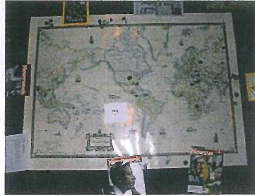
Pray for the world.

Everyone is welcome! Prayer stations are designed for preschoolers through adults. The sanctuary will be open for prayer as well.