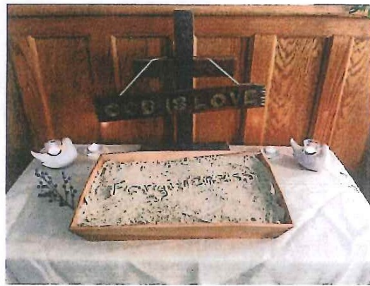
Ask for Forgiveness.